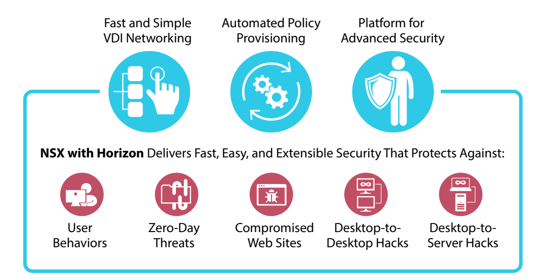
Figure 2: NSX for Horizon Offers Fast, Easy, and Extensible VDI Networking and Security

VMware NSX for Horizon effectively secures east-west traffic within the data center, while ensuring that IT can quickly and easily administer networking and security policy that dynamically follows end users' virtual desktops and apps across infrastructure, devices, and locations.