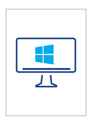
FIGURE 1: Deliver a consistent and dynamic application and desktop experience across any device, location, or Windows operating system.