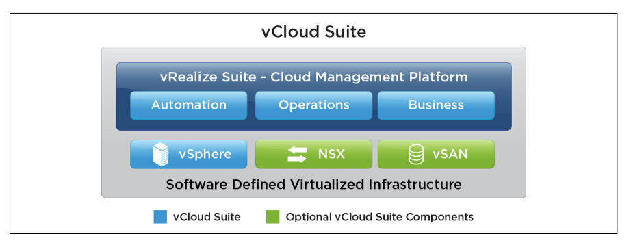
Figure 1: vCloud Suite integrated products

VMware vRealize cloud management products are also natively integrated with VMware SDDC: VMware vSphere, VMware NSX® and VMware vSAN™. NSX constructs such as virtual routers, load balancers and firewalls can be embedded in a service templated (Blueprints) created in vRealize Automation, and instantiated and changed on demand in the context of the running application, based on business needs.